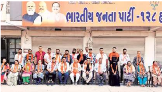
BJP candidates who claimed uncontested victory in the local body elections.